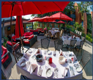
Ruth's Chris Steakhouse